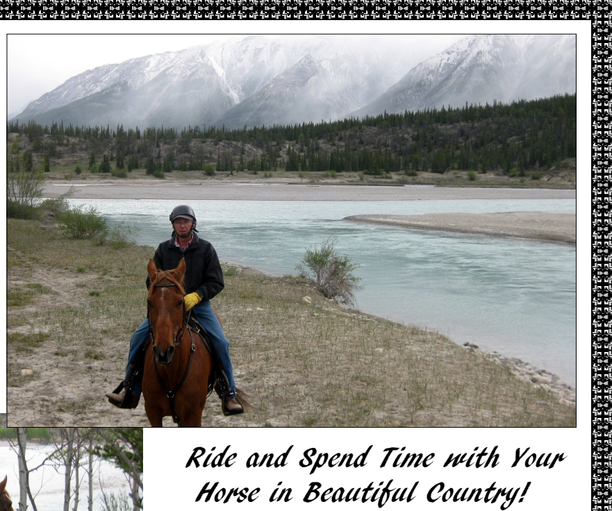
Ride and Spend Time with Your Horse in Beautiful Country!