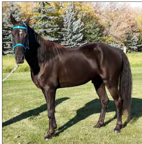
Below: Windi Derman on GHOST OF FUTURE PAST crossing one of the many bridges on the way up to Athabasca Pass. TRAIL 1,2 3.

Centre: CSR RASCAL'S PUZZLE Brenda & Stephen Woodall BASIC SKILLS, DRIVING 1 Also BRONZE Award in the PROGRAM FOR EXCELLENCE