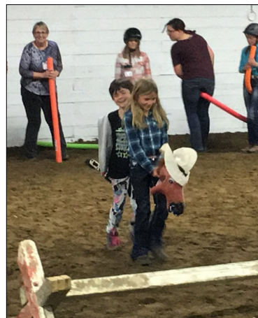
Stick Horse Competition