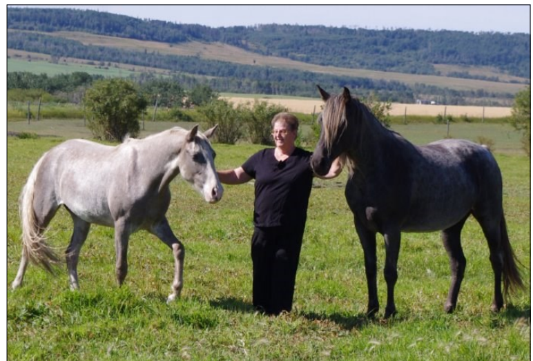
As usual at their place, she's surrounded by Tennessee Walking Horses!